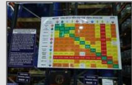
Chemical Compatibility Matrix