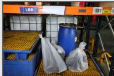
Spill Pallet for LBD (Leakage, Breakage, Damage) purposes