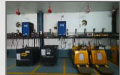
MHE Charging Rooms