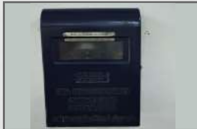
Self Contained Breathing Apparatus