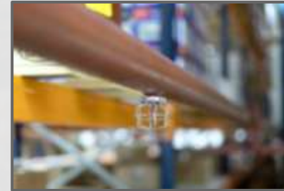
Fire Hydrant System with Top and In-rack Sprinklers