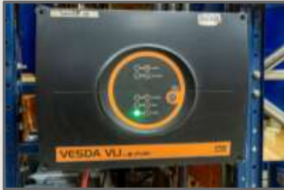
Very Early Smoke Detection Apparatus (VESDA system) – laser-based smoke detector; fire detection between 8 to 9 secs (before visible to human eye)