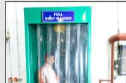
Eye Wash station and Body Shower arrangement