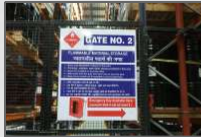
Dedicated Access Controlled Area for Flammable Material Storage